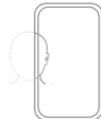
Off-centered reflection for asymmetrical hearing loss