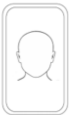
Centered reflection for typical operation

The HyperSound speakers are correctly positioned when the Patient can see his or her reflection centered in each speaker. However, for Patients with asymmetric hearing loss or situations in which you have customized a right and left hearing or tinnitus profile, you may wish to suggest a speaker positioning that provides for a better separation of the left and right beams by positioning the Patient so that only the ears are visible in the speaker reflection, as indicated below.